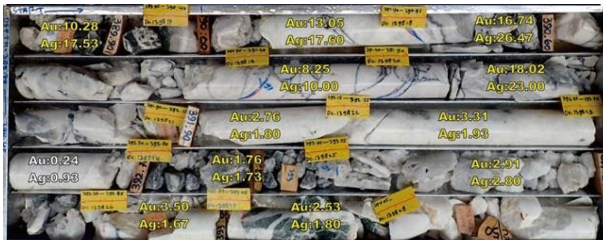
Figure 3. Drill core from Talang Santo 3 Main Vein (DDH-577 - 4.45m @ 8.43 g/t Au and 12.9 g/t Ag from 389.6m, including: 2.95m @ 11.6 g/t Au and 18.5 g/t Ag from 389.6m).

Future exploration drilling at Talang Santo will target down plunge extensions of these mineralised shoots.